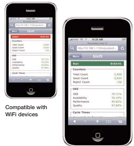
Compatible with WiFi devices

The secret of performance improvement: (Information x Focus) x Actions = Results