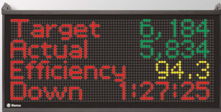
XL800 Size: 35cm (h) x 67cm (w) x 9cm (d), 9kg

If you answer “yes” to any of these questions then you could achieve even better results with our XL-OEE system.